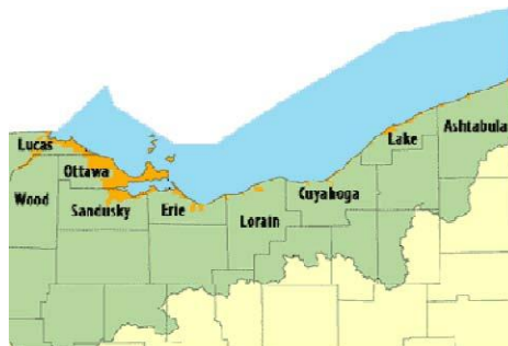
Figure 1. Ohio Coastal Management Program Area, highlighting counties (green) and designated coastal area (yellow) (from ODNR)

As part of the research project a collection and review of available studies and information regarding CAFOs was undertaken to identify the key issues and future studies that would be needed to examine the potential environmental impacts from liquid manure generated by CAFOs within NW Ohio. The effort focused on examining the current literature, scientific studies and published reports regarding CAFOs with special focus on water quality impacts and the handling and disposal of the liquid manure waste from these facilities.