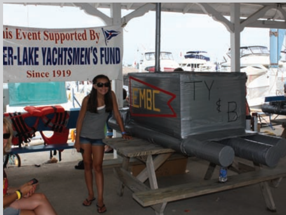
Participants in the 2011 Cardboard Boat Race