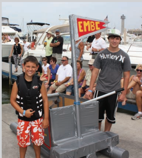
Participants in the 2011 Cardboard Boat Race