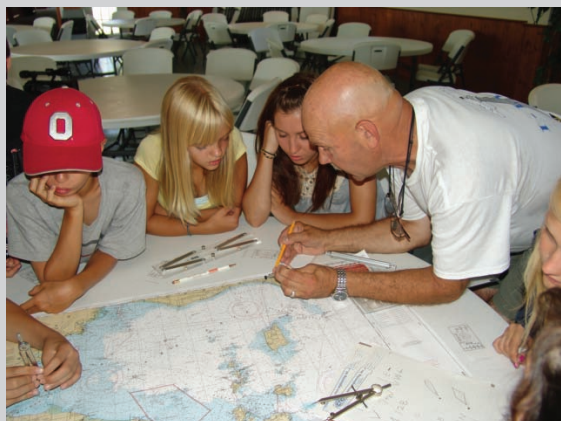
2011 Junior Power Chart Plotting